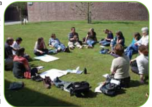
Cork Transition Groups

Presentations were given by reps from Kinsale, Midleton, Bantry and Clonakilty after which we split into two smaller groups - those already established as Transition and those who want to set one up in their community.