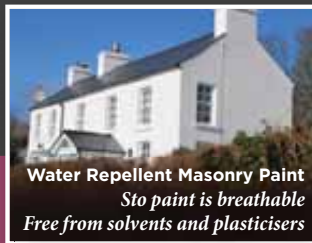
Water Repellent Masonry Paint Sto paint is breathable Free from solvents and plasticisers