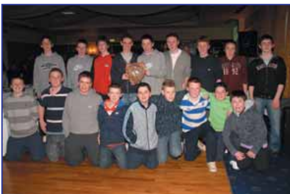
Left: The Kinsale Under 14 team who won the SE hurling championship last year, pictured at the Kinsale Under Age GAA awards in Actons Hotel recently