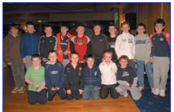
Members of the Kinsale Under 12 panel, pictured attending the Kinsale Under Age GAA awards.