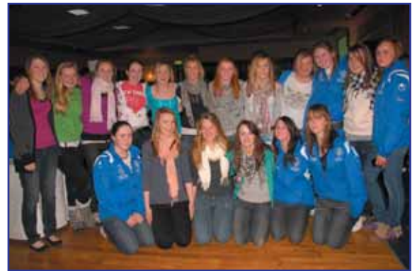
The Kinsale Ladies Football Under 16 team, West Cork League champions 2008, pictured at their annual Kinsale Under Age GAA and ladies football awards in Actons Hotel.

Kinsale had a very successful year and have bright young stars pushing up through the ranks which bodes well for the future of the Club. Here's to a great 2009 season and congratulations to all involved.