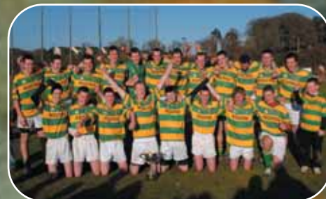
Ballymartle celebrate their very first South East U21 A football championship title following their victory over Ballinhassig in the final at Belgooly recently