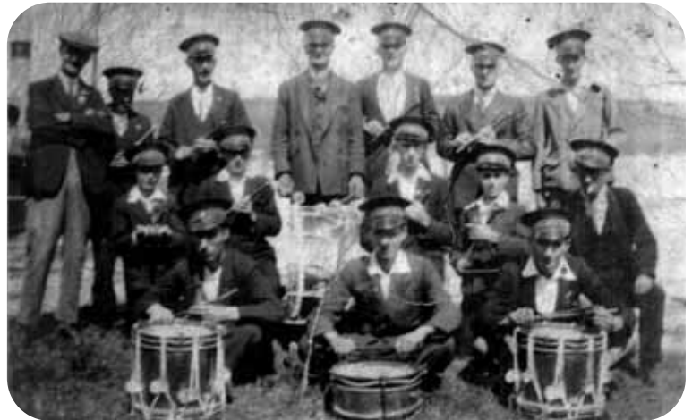
KINSALE FIFE AND DRUM BAND PICTURED IN 1930/31