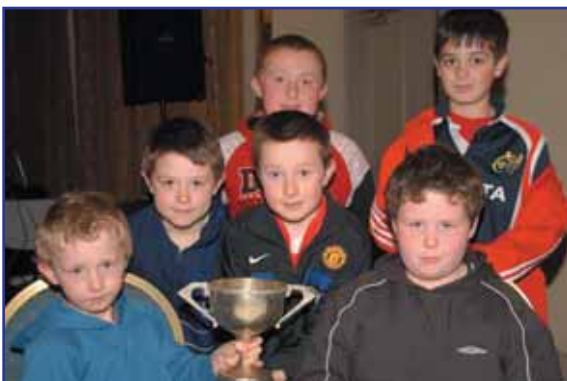
Left: Youngsters from the Under 10 and Under 12 panel at the Kinsale Under Age GAA awards.