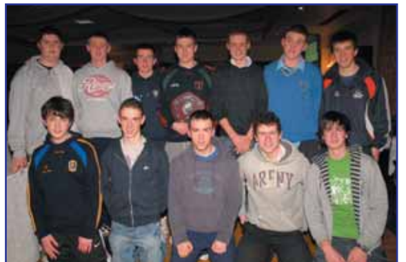
The Kinsale Under 16 team who won the SE hurling league last year, pictured at the Kinsale Under Age GAA awards in Actons Hotel.